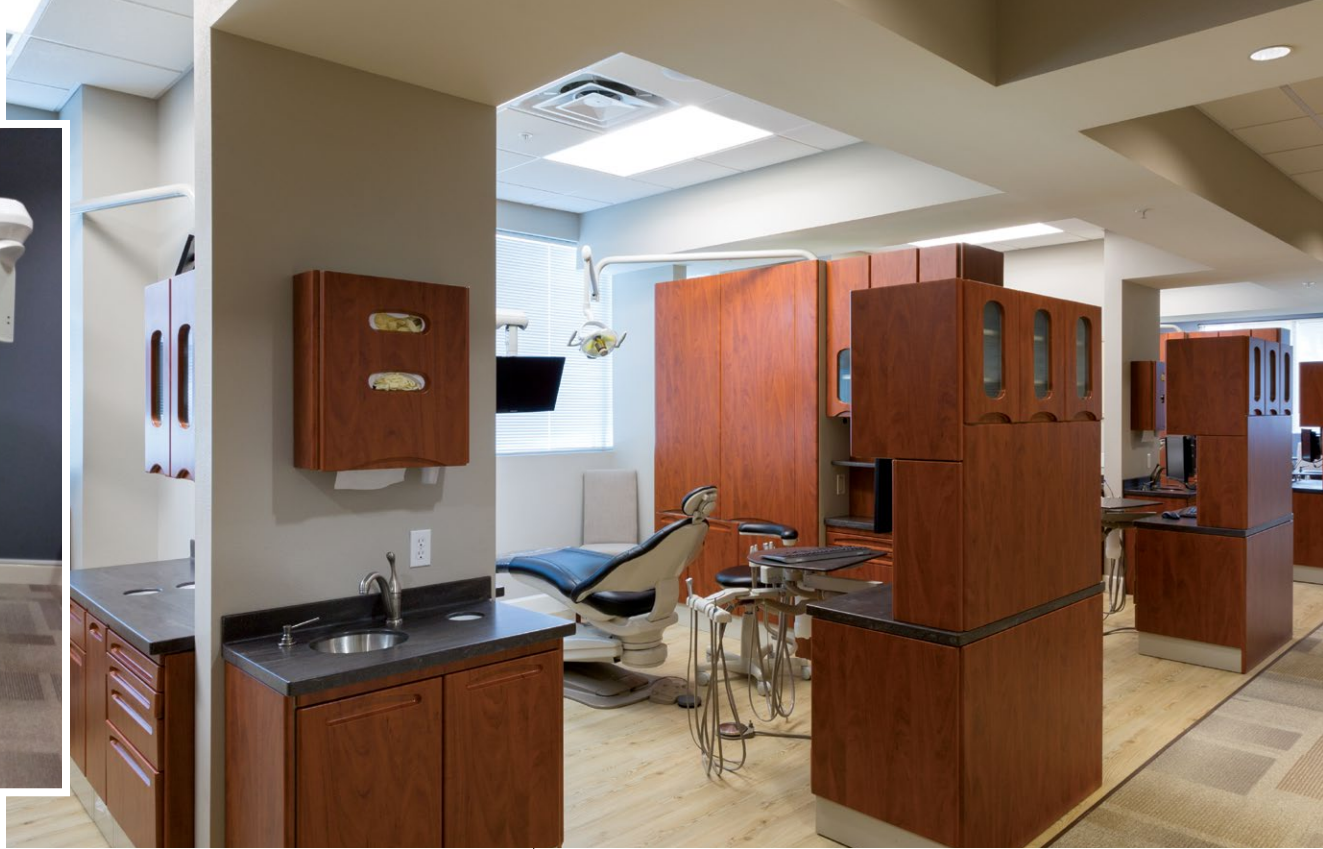
Cherry Midmark cabinetry lends privacy and minimalist elegance to five patient operatories.