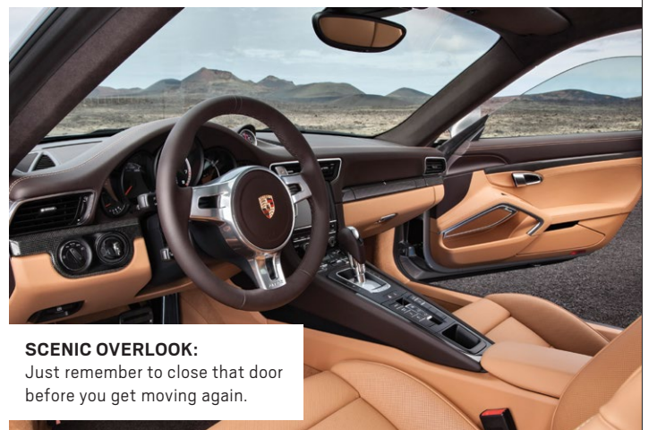
SCENIC OVERLOOK: Just remember to close that door before you get moving again.