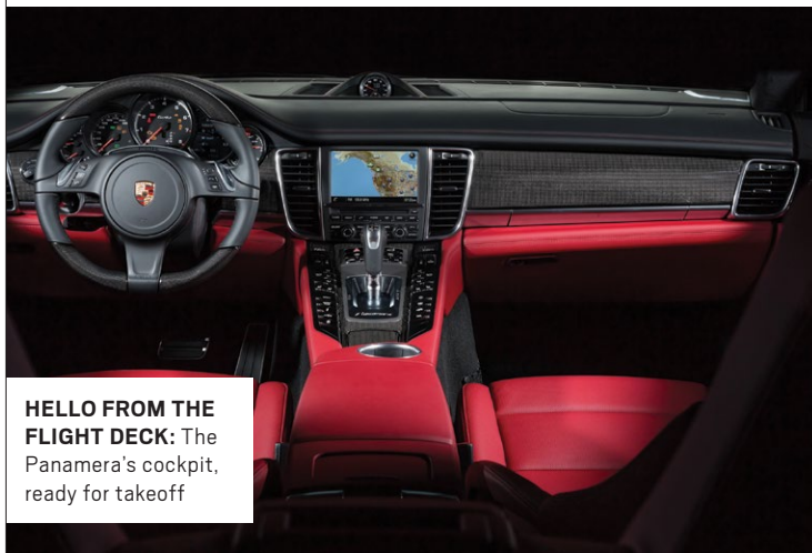
HELLO FROM THE FLIGHT DECK: The Panamera's cockpit, ready for takeoff

The new 911 Turbo S is so high up on the indulgence scale that it could almost be considered papal, but its urbane manners remain soothing for daily use — and really, why shouldn't you sip some champagne every day?